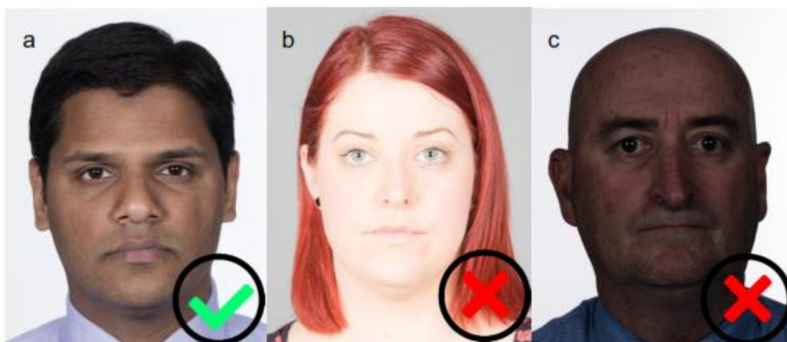
a) Compliant portrait, b) Over exposure, c) Under exposure.