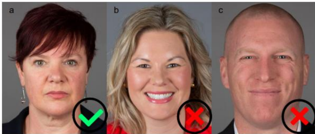
a) Compliant portrait, b) Smiling person, c) Person smiling with closed mouth.