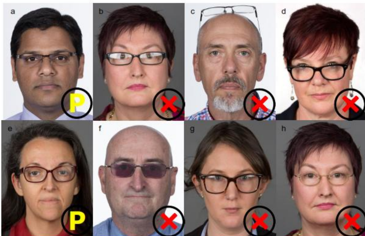
a) Compliant portrait, b) Strong reflections on glasses, c) Glasses worn on the head, d) Frame crossing the eyes, e) Compliant image, f) Sunglasses, g), h) Frames partially covering the EVZ.