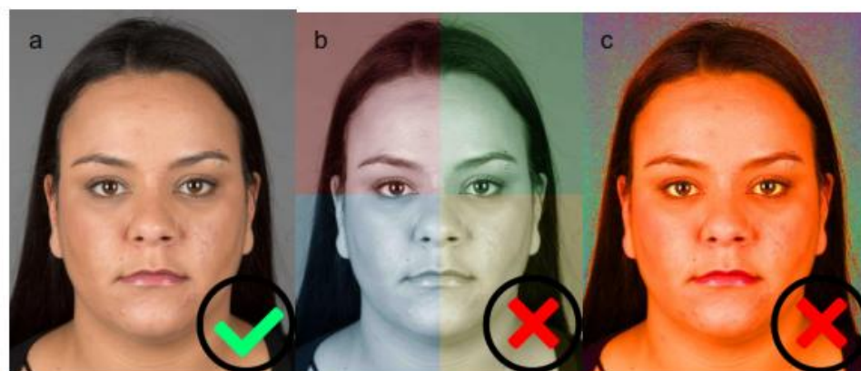
a) Compliant portrait, b) Colour deviations, c) Excessive saturation in hue, saturation, & luminance (HSL) colour space.