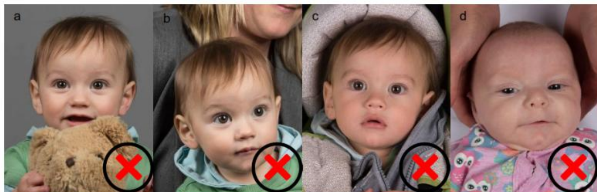
a) Toy, b) supporting person, c) Non-neutral background, d) Supporting hands.