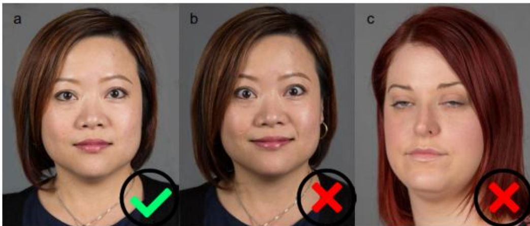
a) Compliant portrait, b) Unnaturally wide opened eyes, c) Eyes not fully opened.