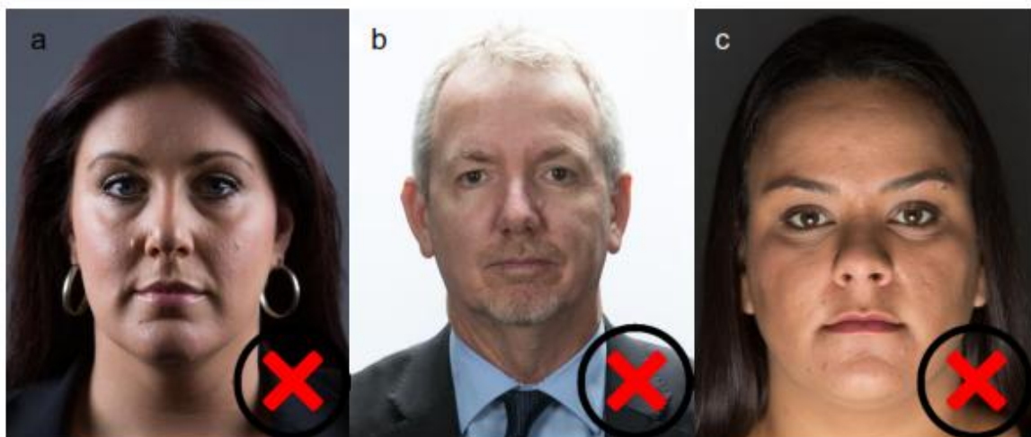
Non-compliant portraits: a) Side illumination, b) Top illumination, c) Bottom illumination.